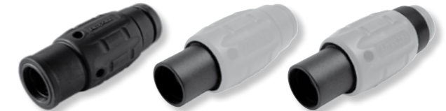
Fig. 1 Aimpoint 3XMag with rubber

In order to use the 30 mm diameter tube(s), the rubber covering that surface must first be removed. Remove rubber from the front tube as shown in fig. 2 below when TwistMount or one ring is used (most common). Remove rubber from both tubes as shown in fig. 3 when both tubes are used. Use a sharp knife and carefully cut through the rubber along the circumferential groove making sure not to cut into the metal body.