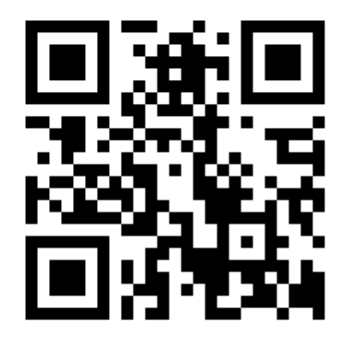
For more information on Bore Sighting and Zeroing your scope, scan the QR code above for an in depth video from Riton University